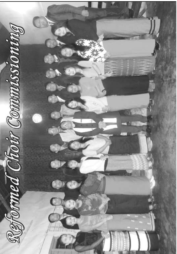
“INDINTHAR” Nehemiah 2:17 Reformed Choir Commissioning